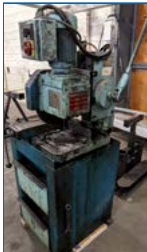
REMI-EISELE VMS350 COLD SAW

CLOSES: Thursday November 2 nd , 11AM ET