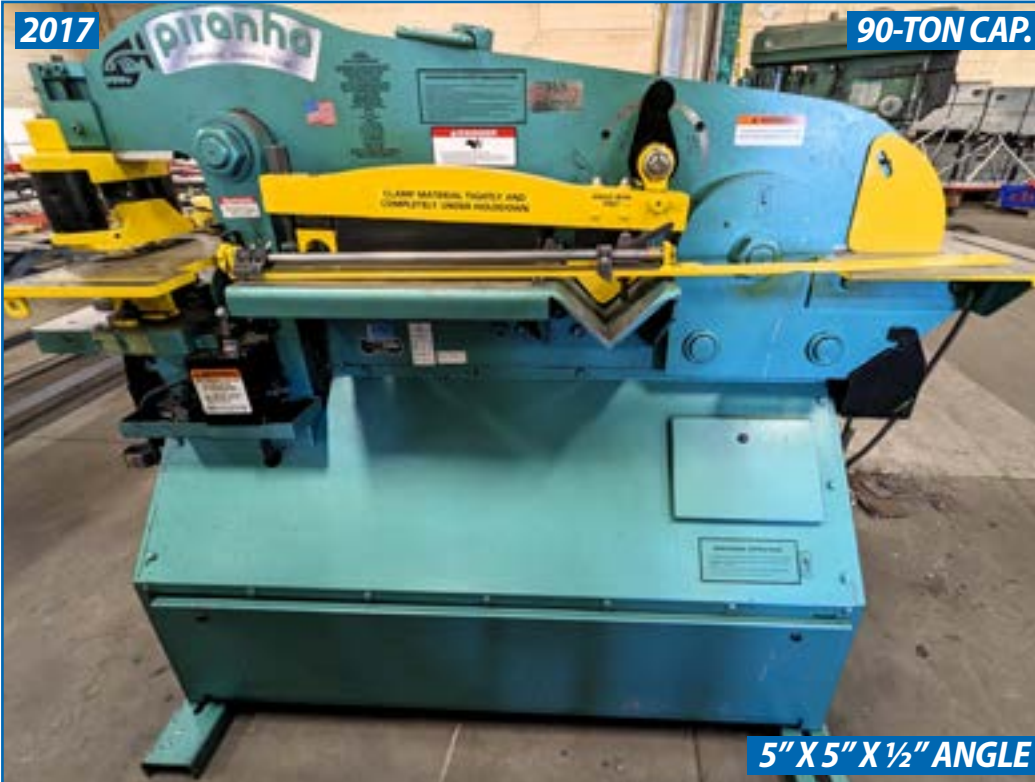
PIRANHA P90 HYDRAULIC IRONWORKER

Architectural Metalcraft Industries Limited Custom Metal Working, Fabrication and Installation Facility 1035 Pantera Drive, Mississauga, ON