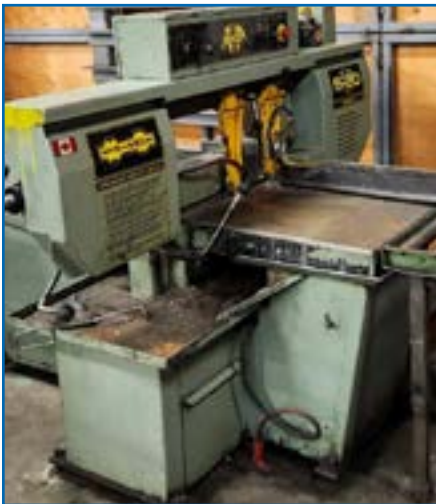
HYD-MECH S-20 SERIES II HORIZONTAL BANDSAW