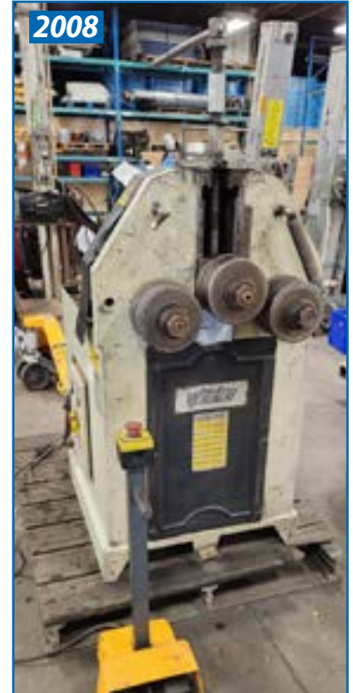
SAHINLER PK-35F HYDRAULIC ANGLE ROLLS