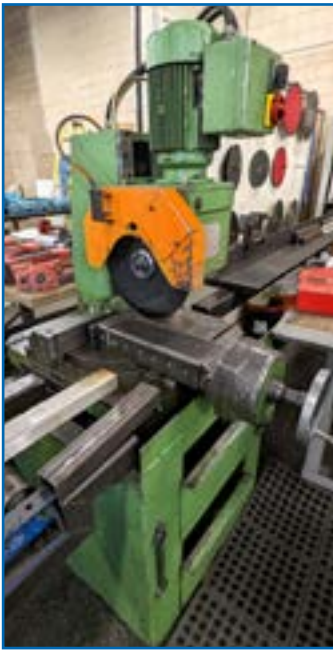
WALTER CS300 COLD SAW