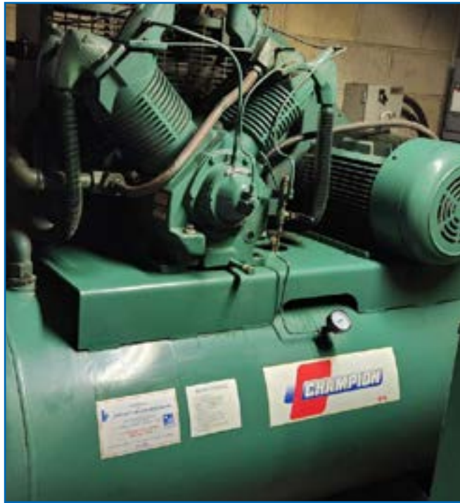
PARTIAL VIEW OF COMPRESSORS