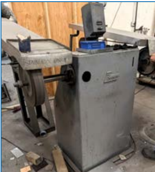
PROGRESS HEAVY DUTY DUAL SANDER/BUFFER