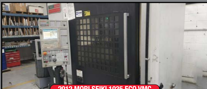
2012 MORI SEIKI 1035 ECO VMC