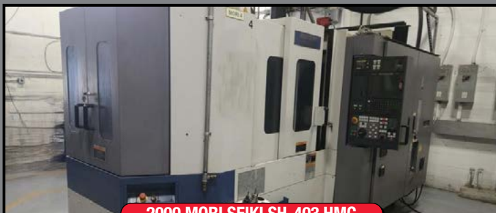
2000 MORI SEIKI SH-403 HMC