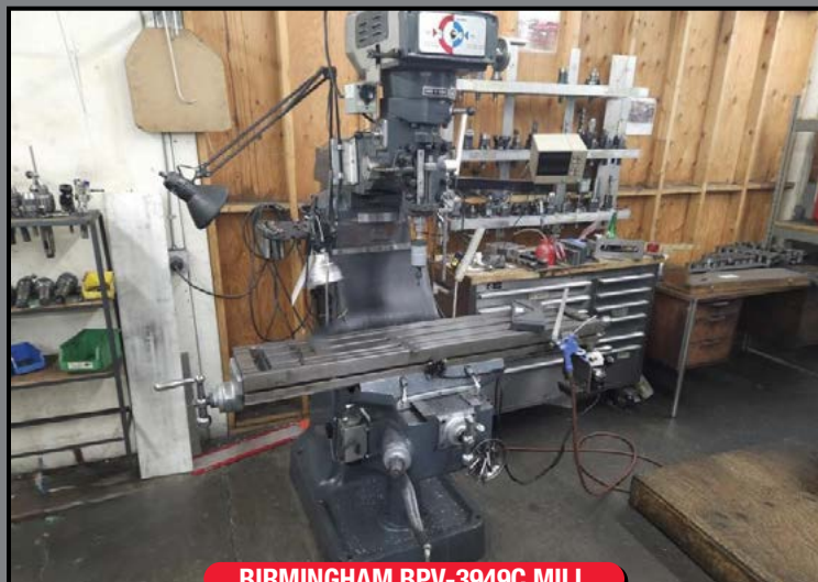
BIRMINGHAM BPV-3949C MILL