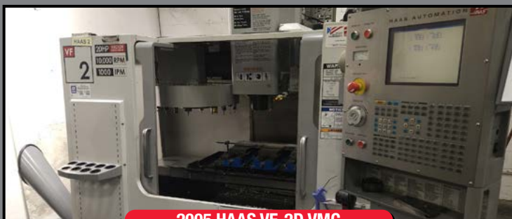
2005 HAAS VF-2D VMC