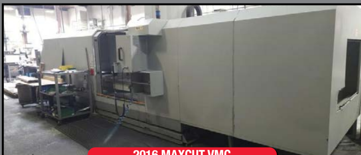
2016 MAXCUT VMC

PLACE: 7505 134A ST., SURREY, BC • PREVIEW: WED., AUG. 6TH, 2025 - 9AM TO 4 PM