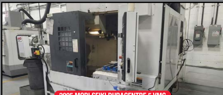
2005 MORI SEIKI DURACENTRE 5 VMC