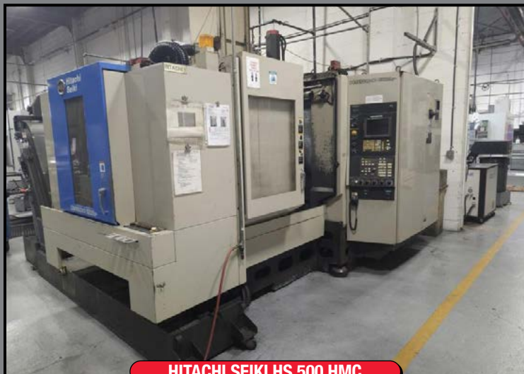
HITACHI SEIKI HS 500 HMC