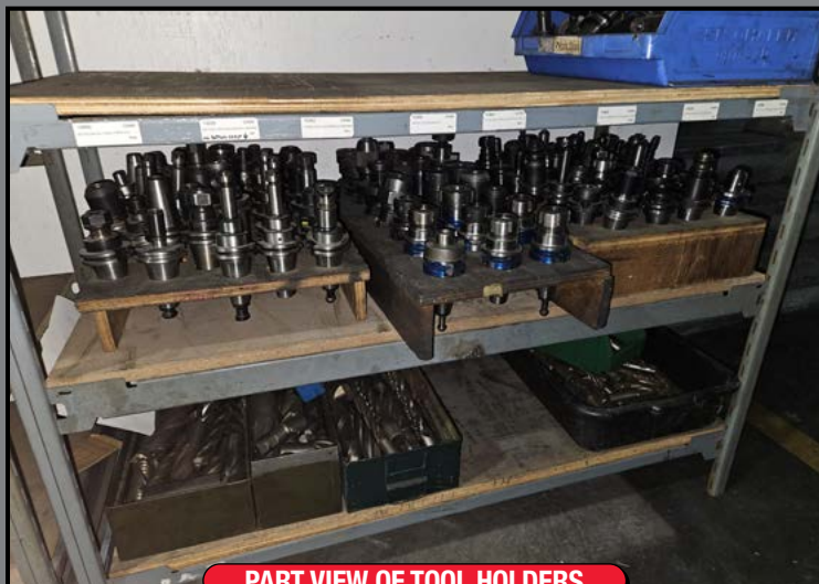
PART VIEW OF TOOL HOLDERS

SELLING OUT? SURPLUS EQUIP? NEED AN APPRAISAL?