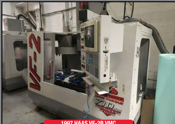
1997 HAAS VF-2B VMC