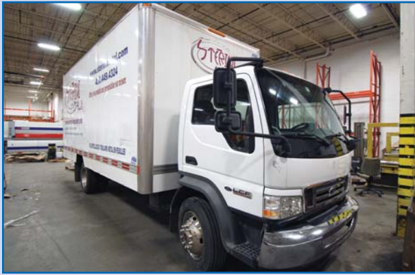
FORD Cube Truck, Model LCF