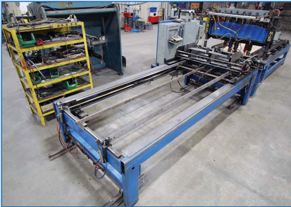
NIKO Model 710, 120KVA Automatic Frame Welding Station