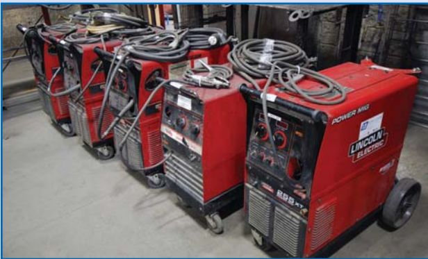
5 LINCOLN ELECTRIC Welders