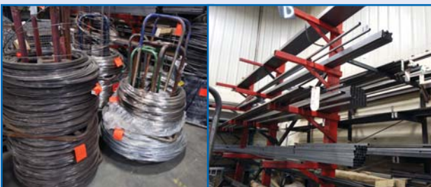
Partial View of Coil and Full Length Raw Material