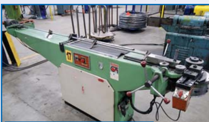
5 Benders Available TEJERO 32A Semi Automatic Tube Bender