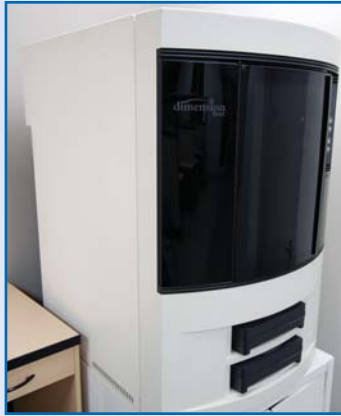
STRATASYS 3D Printer, Model Dimension BST