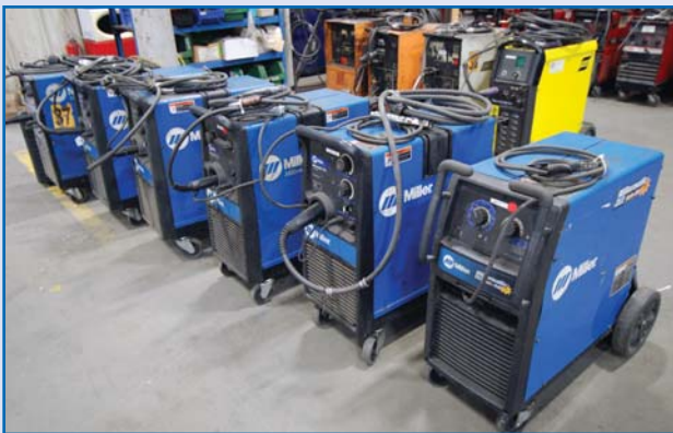
6 MILLER Welders