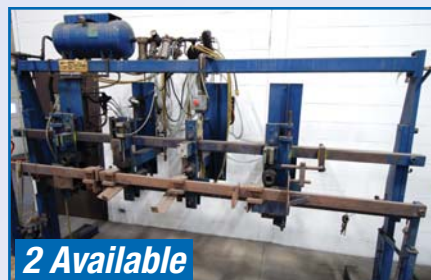
LOBOW 4 Head Wire Frame Bender, Model 45A