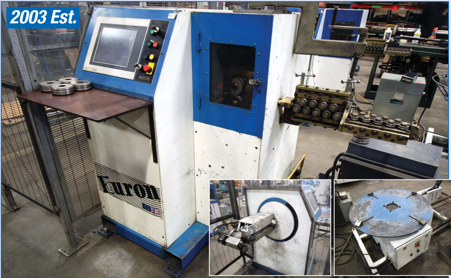
PAVE - HURON 3D CNC Wire Bender, Machine Series 8600, Provit 5200 Control, Uncoiler, Safety Enclosure, sn 8602