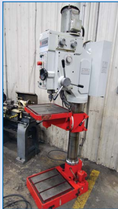
SOUCO Vertical Drill, Model D5035A