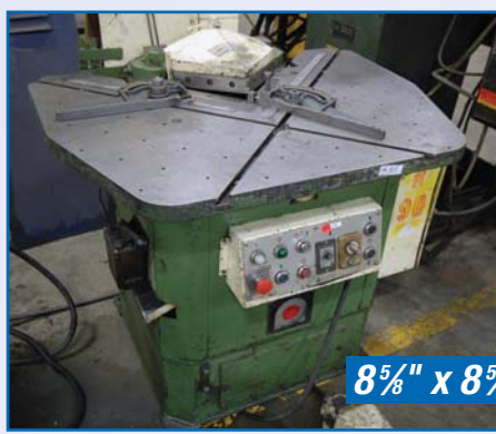
AMADA 10 Ton Corner Notcher