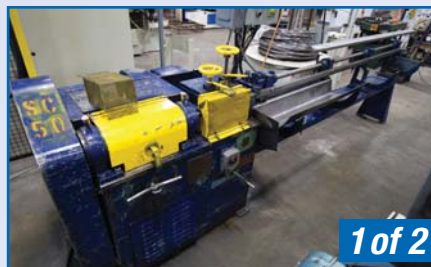
SHUSTER Wire Straightener