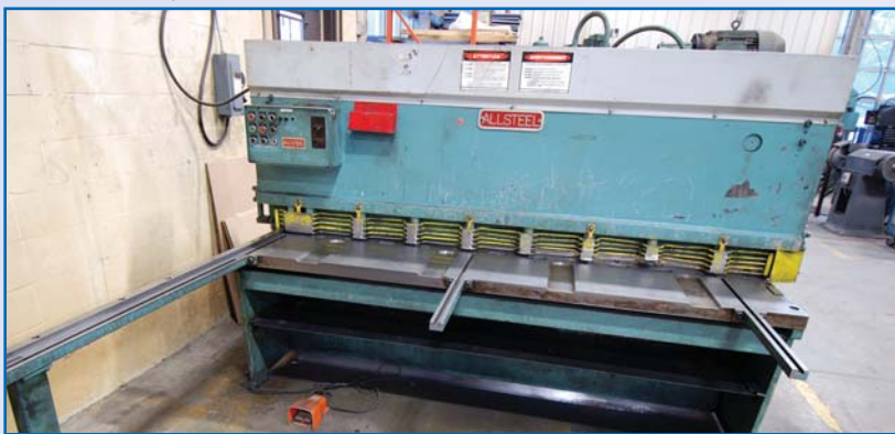
ALLSTEEL 10 Gauge x 8' Shear