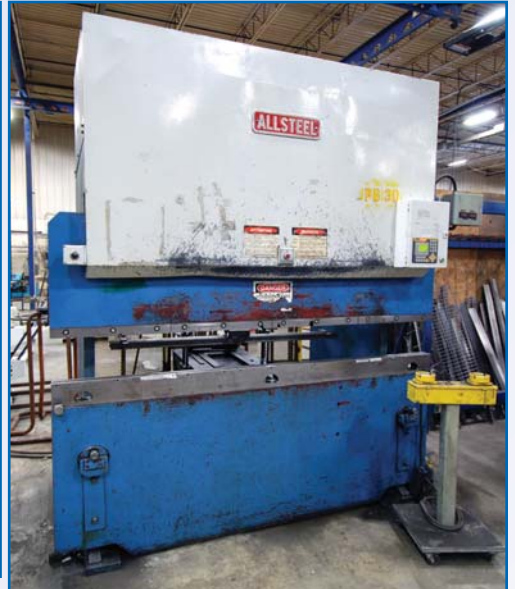
ALLSTEEL Model 120-8, 120 Ton x 8'