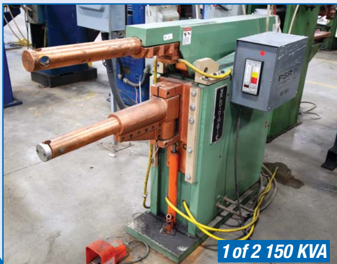
WELDOMATIC , Model AF3A, 150 KVA

Auctioneer's Note: Mask Cell Consisting of AIM, PAVE and Certain Inventory, As Well As The Robotic Weld Cells May Be Offered Two Ways: Bulk Lot Or Individually.