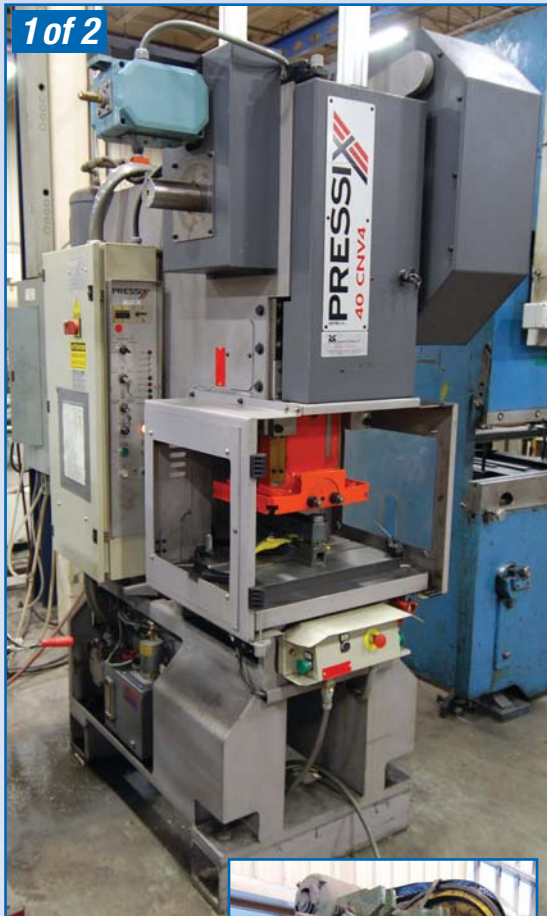
PRESSIX Model 40CNV4, 45 Ton Press

PERKINS 60 Ton OBI, Model 650-B, 3" Ram, 14.5" Shut Height, 1.5" Stroke, 2" Shank, Bed Size 31"x20", Air Clutch, sn 27427