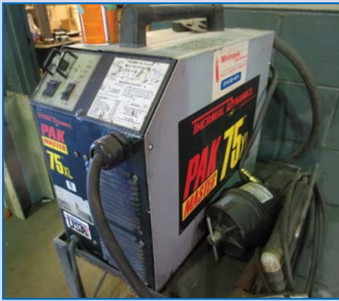
THERMAL DYNAMICS PORTABLE PLASMA CUTTER