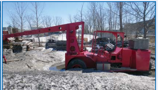
10 TON BULL MOOSE