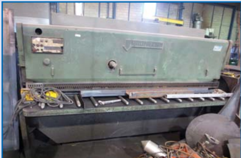
PROMECAM 10' X 1/4" SHEAR