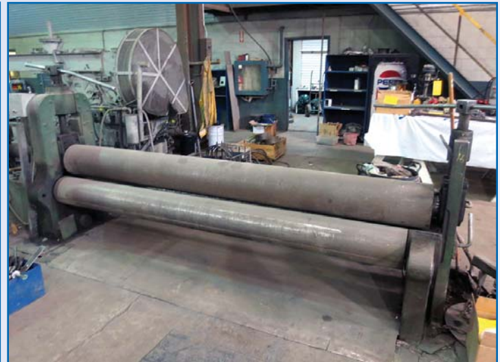
WEBB 10' X 1/2" PYRMID ROLLS