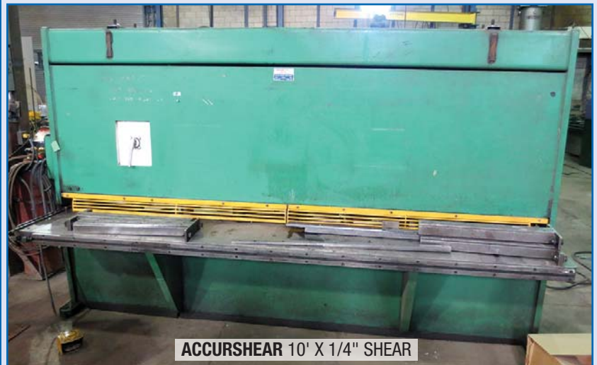
ACCUR SHEAR 10' X 1/4" SHEAR