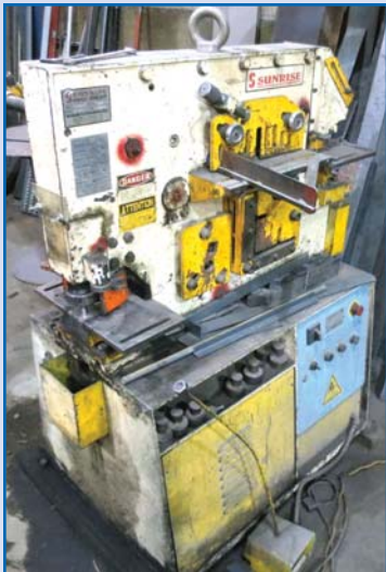
SUNRISE HYDRAULIC IRONWORKER