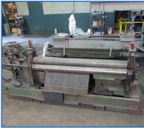
6' INITIAL PINCH ROLLS