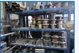
VIEW OF RAW MATERIAL

Short Notice Sale Including: Plasma Table, Flangers, Circle Shears, Welders, Horizontal Bandsaws, Machine Tools, Lathe, Air Compressor, Jib Cranes, Presses, Dies, Hand Tools, Tank Turning Rolls Hand Tools Steel Inventory And So Much More! For Complete Terms & Conditions, Removal Times and Directions, Please Visit infinityassets.com For Details.