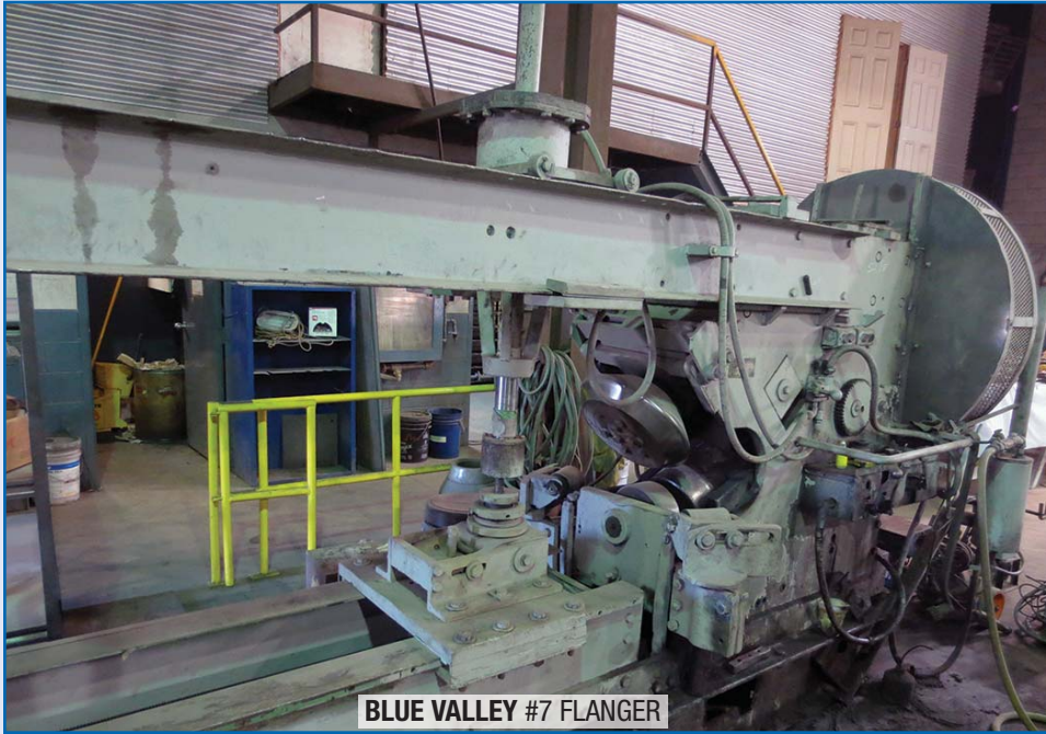
BLUE VALLEY #7 FLANGER