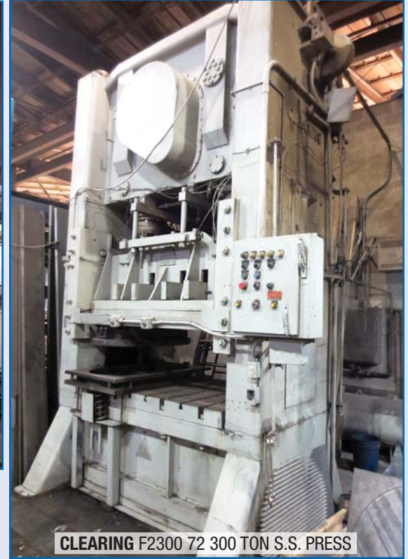
CLEARING F2300 72 300 TON S.S. PRESS