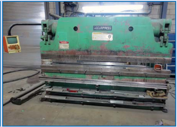
ACCURPRESS 71301 130 TON X 10' PRESS BRAKE