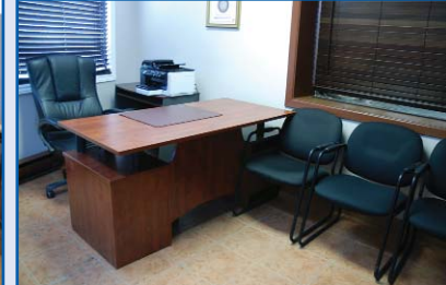
SEVERAL LATE MODEL OFFICE DESKS AND SUITES