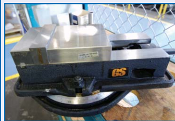
GS PRECISION VISE