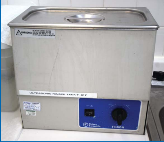
FISHER SCIENTIFIC ULTRASONIC RINSER MODEL FS60H

KK Precision's LPI equipment can process components up to 24" x 30" x 48" and up to 500 lb.