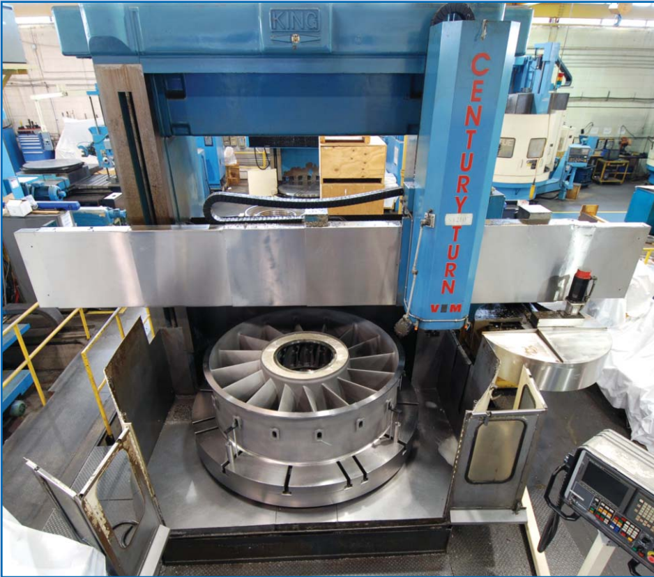
CENTURY TURN , Model VBM, Fanuc 18i-T, Table Diameter 90", Max Swing 92.9", Max Turn Height 70", Tool Head Travels: X-51.2", Z-40", 300 RPM, 15 ATC, Max Table Load 39,683 lb, 60 HP, 240V, sn 17338 (King - Mechanical Recondition 2000)