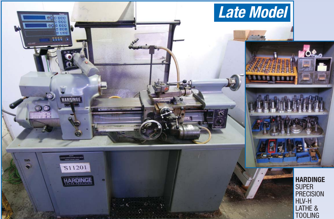
HARDINGE SUPER PRECISION HLV-H LATHE & TOOLING