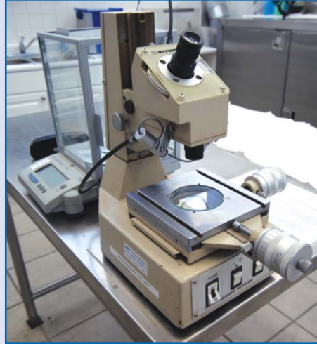
MITUTOYO TOOLMAKERS MICROSCOPE MODEL TM-101