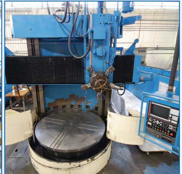
GIDDINGS & LEWIS 60 VTL , Fagor 8055/A-T Control, Upgraded in 2000, 60" 4 Jaw Table Diameter, Max Swing 71.9", Max Turn Height 57.9", Tool Head Travels: X-50", Z-57.9", 5 ATC, Max Table Load 27,557 lb, 300 RPM, 75 HP, 480V, sn 510-6968