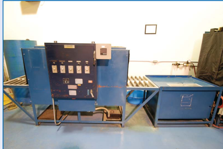
ZYGLO FLUORESCENT LIQUID PENETRANT STATION MODEL ZD-2972