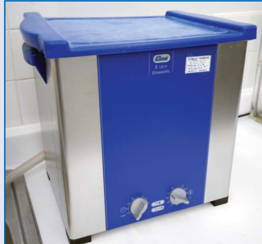
ELMA E120H ELMASONIC CLEANER