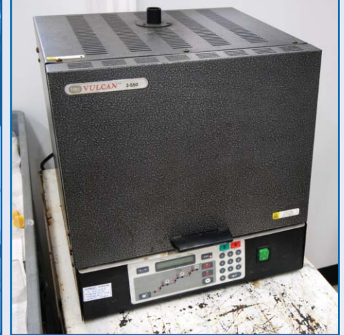
NEY VULCAN 3-550 TABLE TOP OVEN