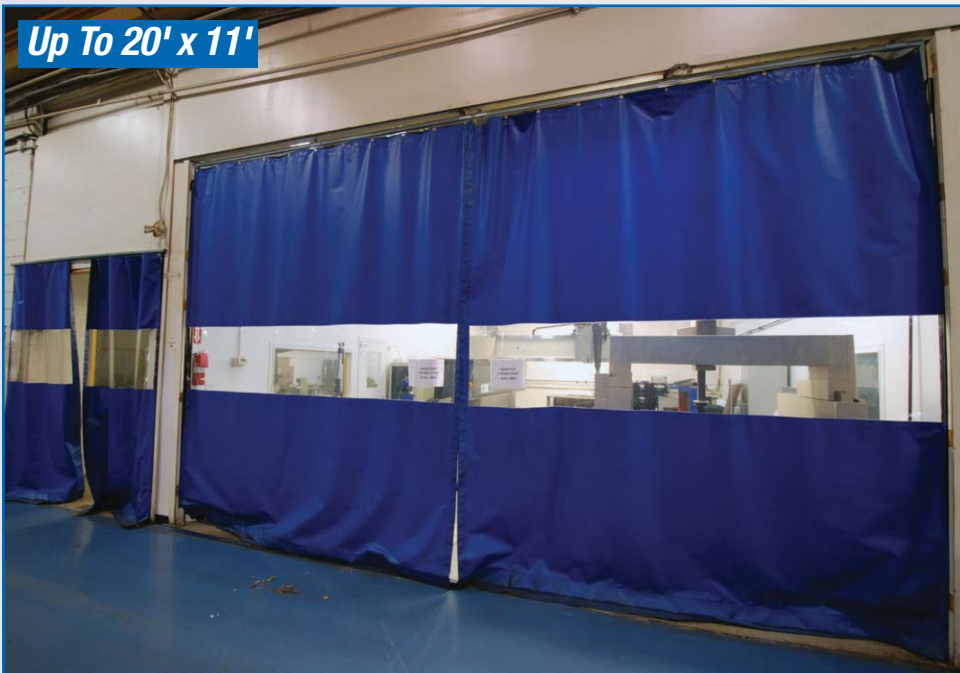
CLEAN ROOM PARTITIONS