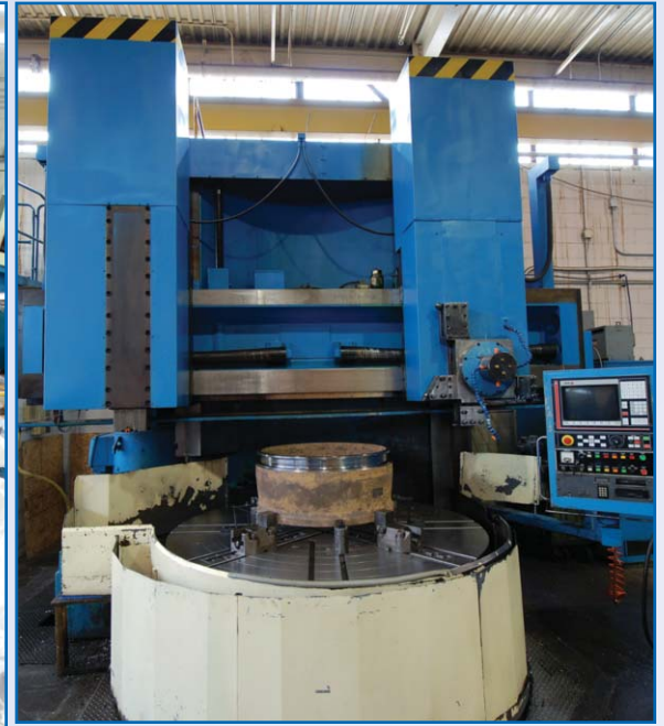
TOS SKJ20 , Fagor 8050-T 3 Axis Control, Table Diameter 78.7", Max Swing 90.5", Max Turning Height 59.1", Tool Head Travels: X-51.2", Z- 29.4", Dual Rams, 4 ATC, 160 RPM, Max Table Load 33,069 lb, 93 HP, Trabon Modu Flow Pump Package, 380V, sn 22120004