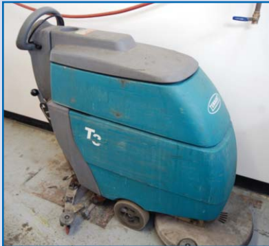
TENNANT FLOOR SWEEPER, MODEL T3