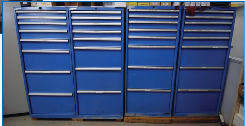
PARTIAL VIEW OF VIDMAR & LISTA CABINETS