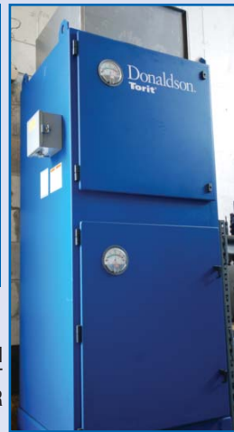
DONALDSON TORIT 3 HP DUST COLLECTOR