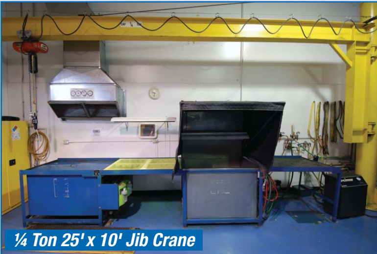
¼ Ton 25' x 10' Jib Crane

Magnetic Particle Inspection (MPI) Booth, Modular, Approx 12'x10'x12', 2 Spectroline SB 1125 Hand Held Inspection Lights, Available 10'x8' ¼ Ton Jib Crane