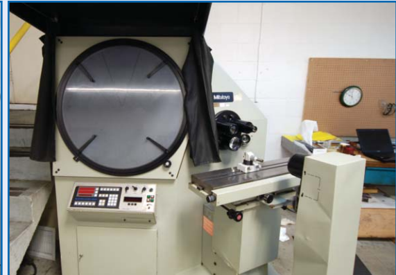
MITUTOYO OPTICAL COMPARATOR, MODEL PO/750/D