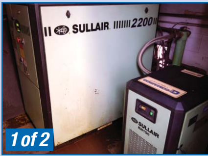
SULLAIR 30 HP AIR COMPRESSOR & DRYER