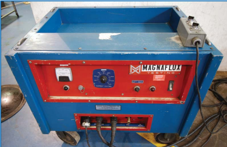
MAGNAFLUX P-500 TEST STATION