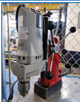
MILWAUKEE MAG DRILL