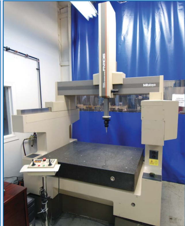
MITUTOYO CMM, MODEL FN-1106