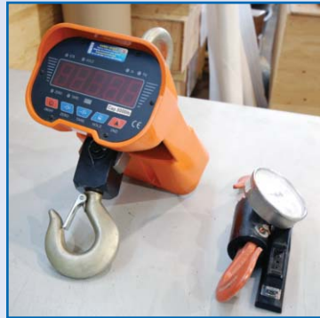
GAMMA 5,000 LB CAPACITY CRANE SCALE

AUCTIONEER'S NOTE: All Machine Hours Listed In Brochure Are As Of The Time Of Printing. Some Machines May Have Additional Hours.