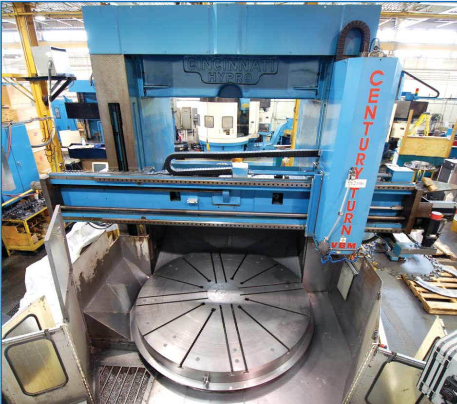
CENTURY TURN , Model VBM, Fanuc 18iT, Table Diameter 96", Max Swing 103.9", Max Turn Height 71.9", Tool Head Travels: X-55.1", Z-40", 120 RPM, 15 ATC, Max Table Load 44,092 lb, Chip Conveyor, 60 HP, 240V, sn 2016 (Cincinnati - Mechanical Recondition 2000)