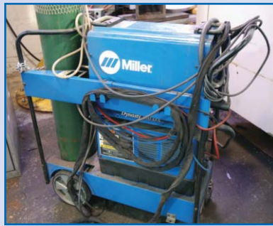
MILLER DYNASTY 300DX WELDER