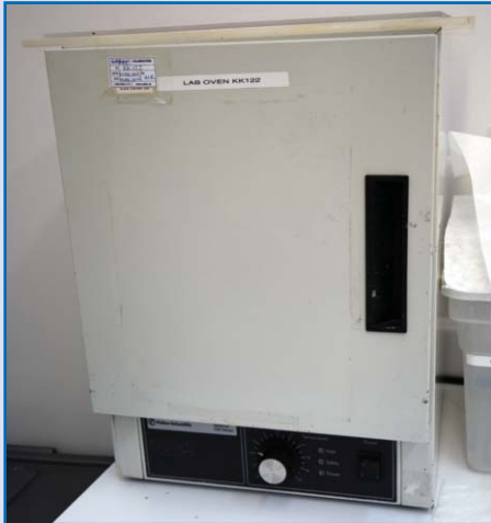
FISHER SCIENTIFIC ISOTEMP 500 SERIES OVEN