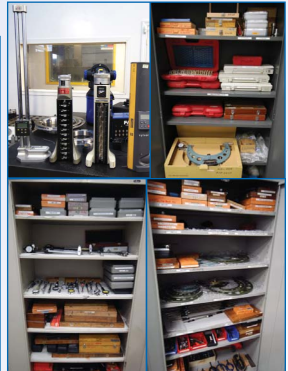
PARTIAL VIEW OF PRECISION INSPECTION