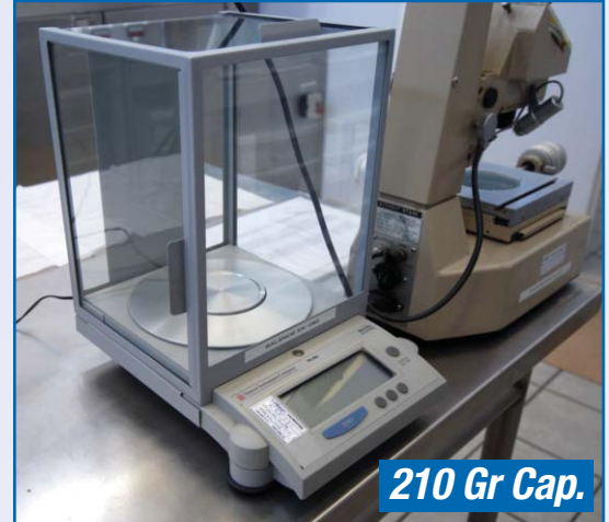
DENVER INSTRUMENT PRECISION SCALE MODEL TR-204