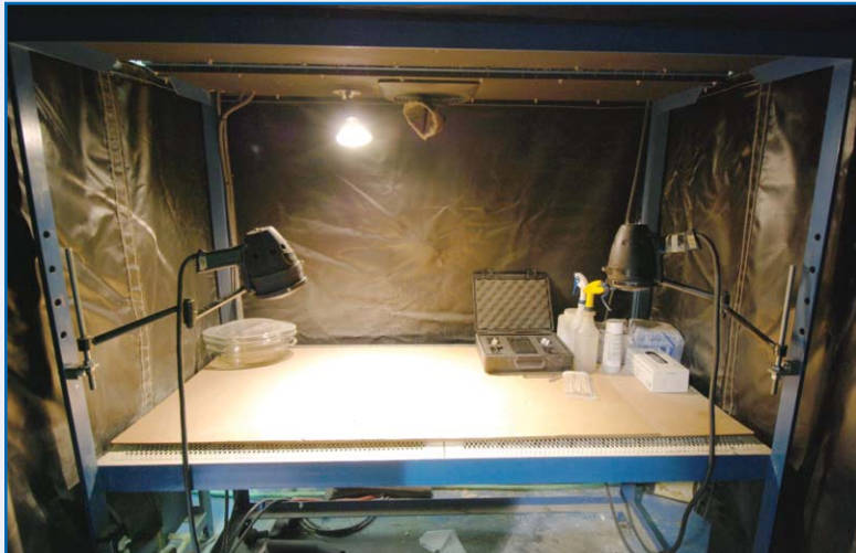
ENCLOSED IN LINE INSPECTION STATION