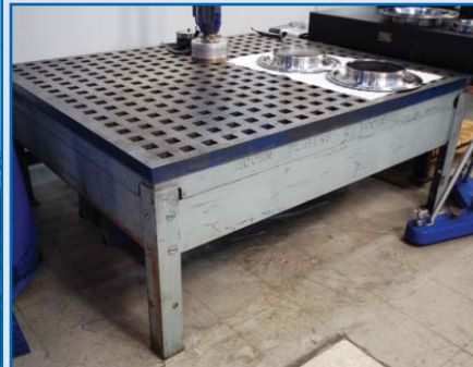
ACORN 5'X6' WELD TABLE