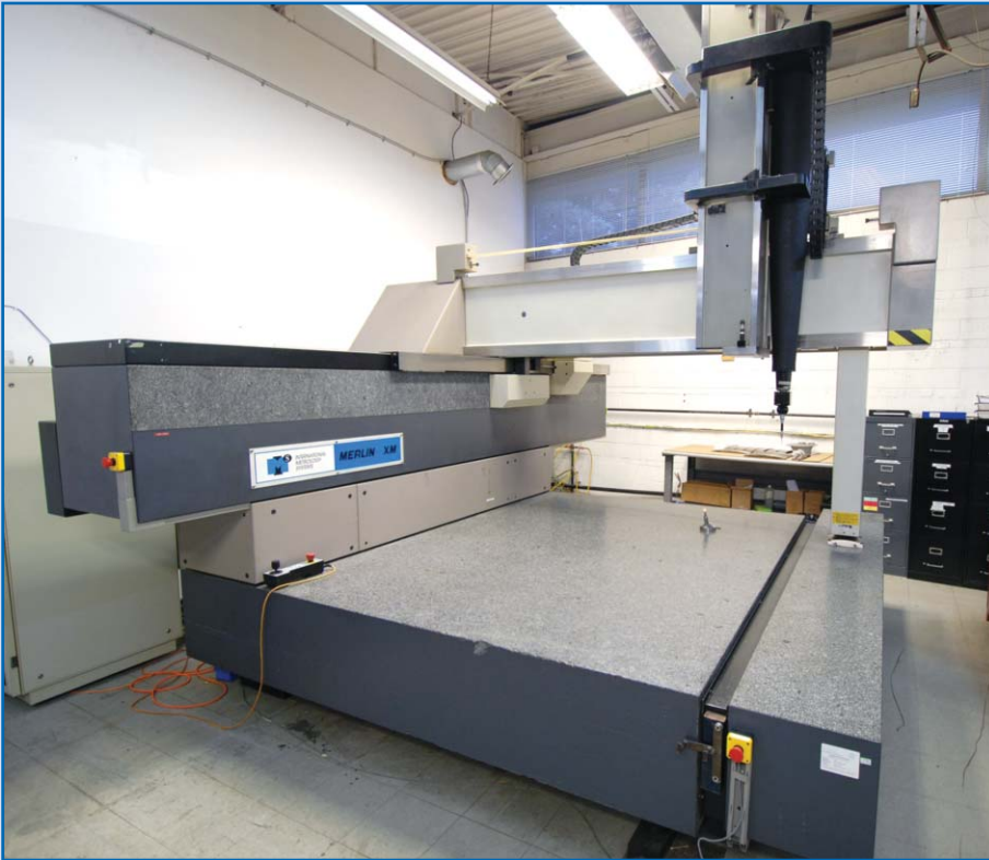
FERRANTI IMS CMM, MODEL MERLIN XM