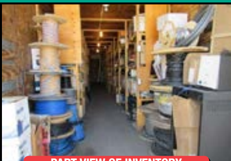
PART VIEW OF INVENTORY