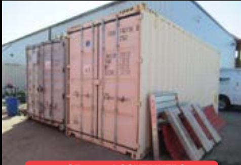
2 OF 10 20' CONTAINERS