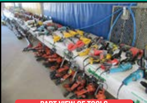
PART VIEW OF TOOLS