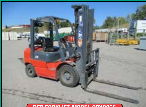
DEP FORKLIFT, MODEL CPYD25S