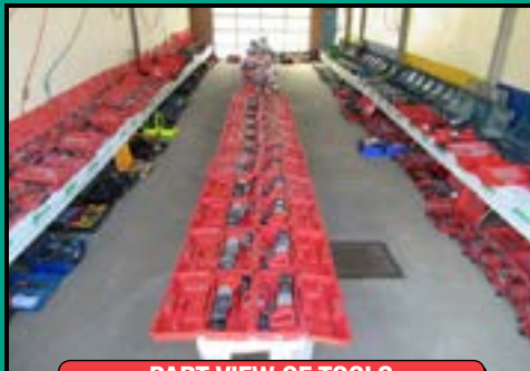
PART VIEW OF TOOLS