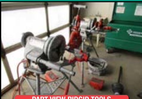
PART VIEW RIDGID TOOLS