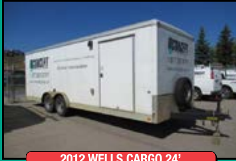
2012 WELLS CARGO 24'