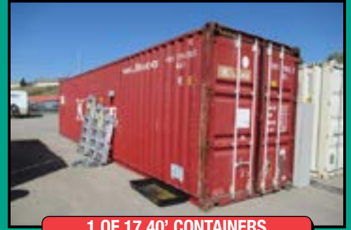
1 OF 17 40' CONTAINERS