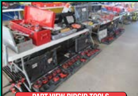
PART VIEW RIDGID TOOLS