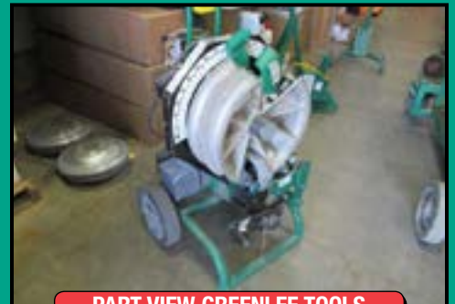
PART VIEW GREENLEE TOOLS