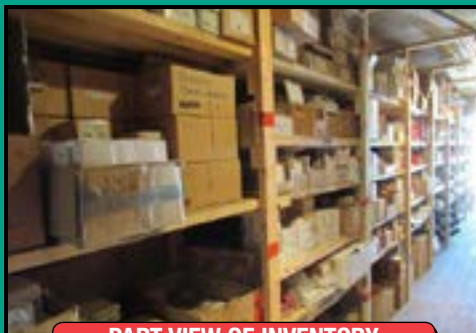
PART VIEW OF INVENTORY