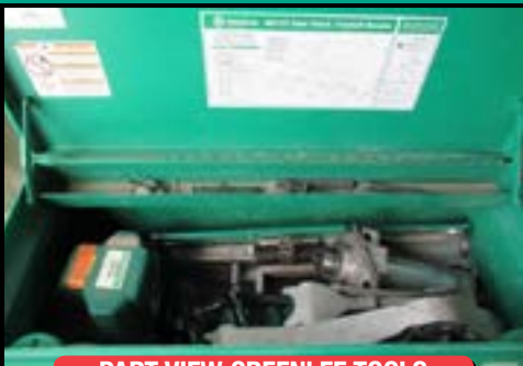
PART VIEW GREENLEE TOOLS