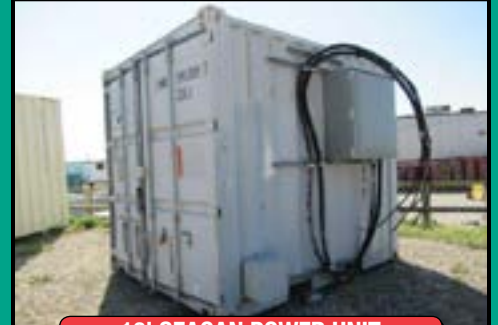
10' SEACAN POWER UNIT