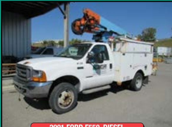
2001 FORD F550, DIESEL

PLACE: 1260 HIGHFIELD CRES. SE, CALGARY, AB, CANADA • PREVIEW: WED., SEPT. 19TH, 9AM – 5PM