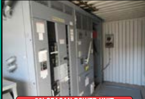
20' SEACAN POWER UNIT