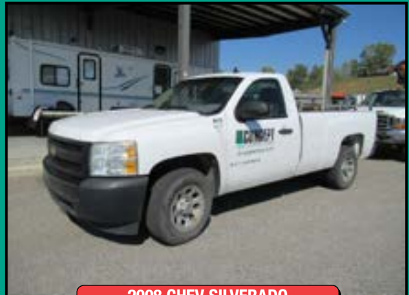
2008 CHEV SILVERADO