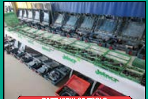
PART VIEW OF TOOLS