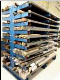
RACKS & RAW MATERIAL/ BAR STOCK