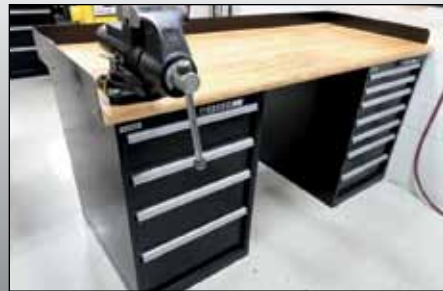
NUMEROUS LISTA WORK STATIONS