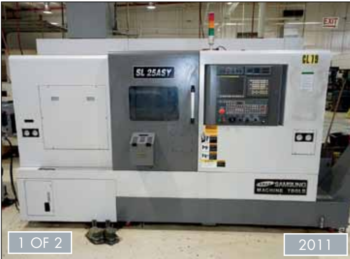
SAMSUNG 5-AXIS CNC TURNING CENTERS, MODEL SL25ASY, EDGE PATRIOT 551 BAR FEED