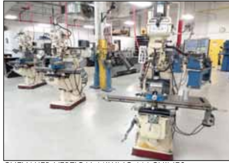
CHEVALIER VERTICAL MILLING MACHINES