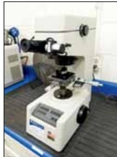
LECO M-400-G1 HARDNESS TESTER