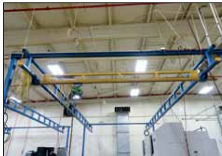
NUMEROUS GORBEL CRANE SYSTEMS