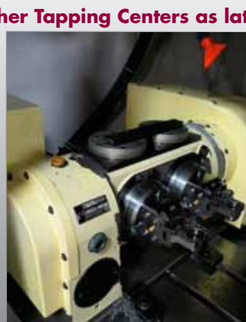
NUMEROUS NIKKEN 5AX-2HT 5TH AXIS TILTING DUAL SPINDLE ROTARY TABLES