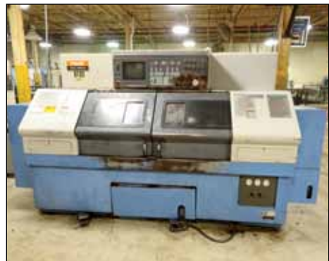
MAZAK DUAL TURN 20 CNC