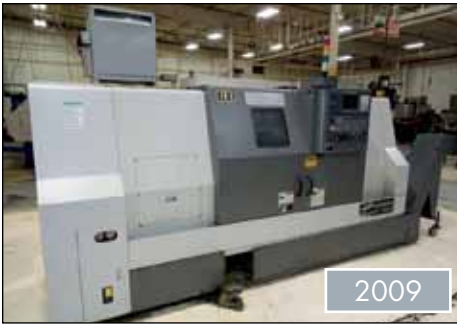
2009 SAMSUNG CNC TURNING CENTERS, MODEL SL30A/1000