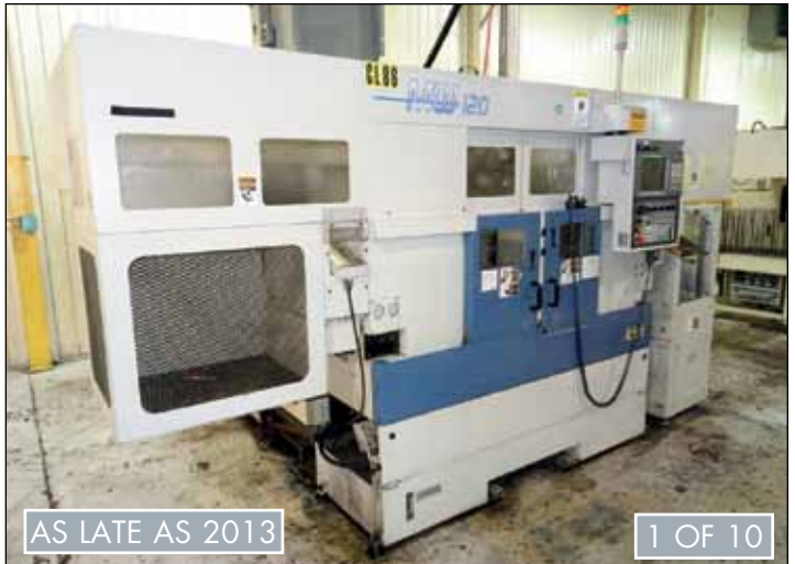
MURATEC TWIN SPINDLE CNC CHUCKERS, MODEL MW120