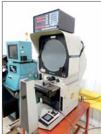
DELTRONIC OPTICAL COMPARATOR