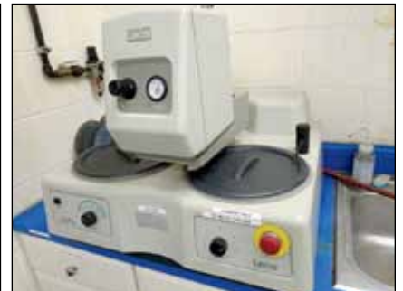
LECO DUAL HEAD POLISHER