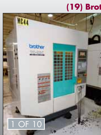
1 OF 10 BROTHER DRILLING & TAPPING CENTERS, MODEL TC-S2DN, 4TH AXIS