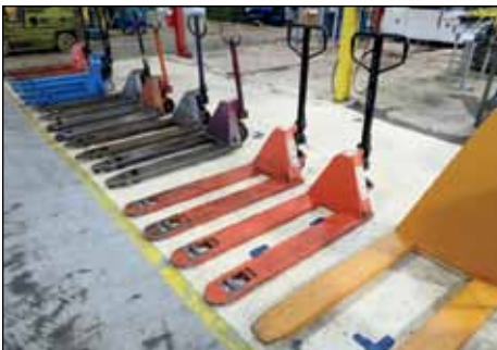
VIEW OF PALLET JACKS