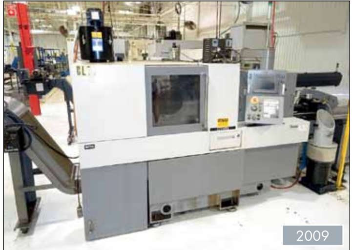
CITIZEN CNC SWISS TYPE BAR TURNING CENTER, MODEL CINCOM A32/0148, W/ EDGE CITIZEN 332 BAR FEED