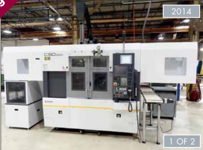
FUJI TWIN TWO SPINDLE CNC LATHE, MODEL CSD300

Online Auction (Support Assets) *Electronic Bidding Only Tuesday, June 21st, 2016 at 9:00 AM (EDT)