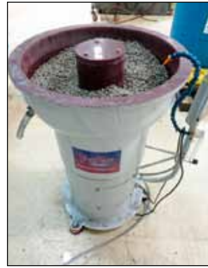
NUMEROUS VIBRATORY BOWL MEDIA FINISHERS