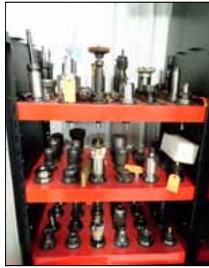
VIEW OF TOOLING