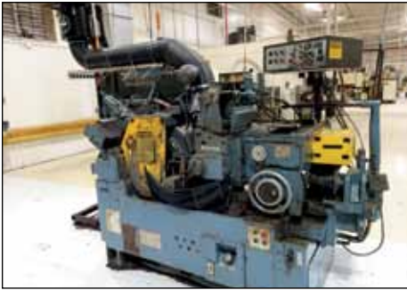
CINCINNATI MILACRON CENTERLESS GRINDERS, MODEL 220-8 CENTURAMIC DR & 20M