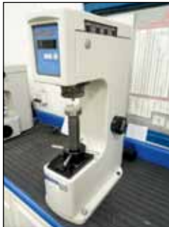
MITUTOYO HARDNESS TESTER