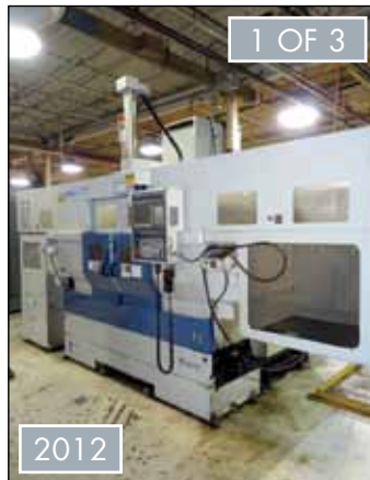
1 OF 3 2012 MURATEC TWIN SPINDLE CNC CHUCKERS, MODEL MW200