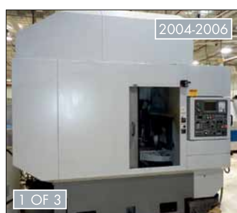
2004-2006 1 OF 3 HYUNDAI KIA HIV50D CNC VERTICAL MACHINING CENTER