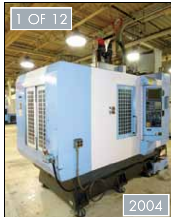
1 OF 12 2004 KIRA CNC VERTICAL MACHINING CENTERS, MODELS KN40V6, VTC30E, VTC-40S, & KN40VS