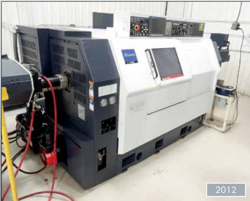
MIYANO CNC TURNING CENTERS, MODEL BNA-42S, EDGE MIYANO 542 BAR FEED