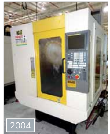
2004 FANUC ROBODRILL MODEL ALPHAS 21LD DRILLING & TAPPING CENTER