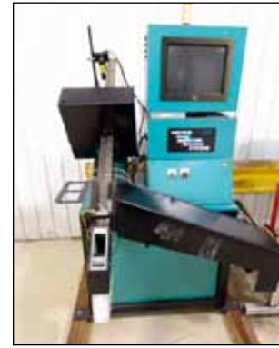
MECTRON PARTS INSPECTION SYSTEM