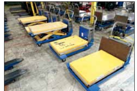
VIEW OF POWER DIE LIFT TABLES