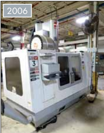
2006 HAAS CNC VERTICAL MACHINING CENTER, MODEL VF-3SS