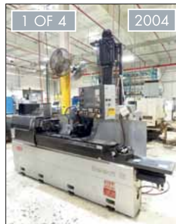
1 OF 4 2004 TOYODA CNC UNIVERSAL CYLINDRICAL GRINDERS, MODEL SELECT G-100