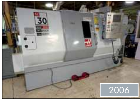
2006 HAAS CNC TURNING CENTER SL-30T