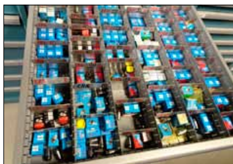
HUGE ASSORTMENT OF TOOLING