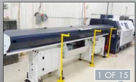
EDGE BAR FEEDERS