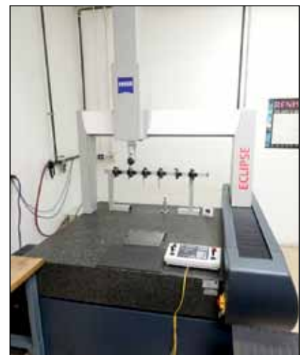
ZEISS CNC COORDINATE MEASURING MACHINE, MODEL EC4040