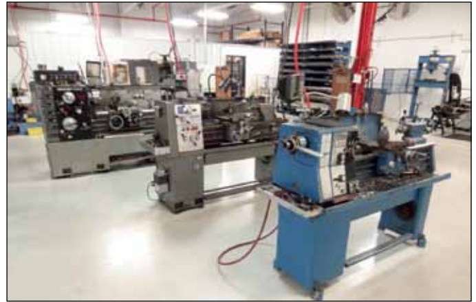
CLAUSING COLCHESTER, HARDINGE, SHARP ENGINE & TOOLROOM LATHES