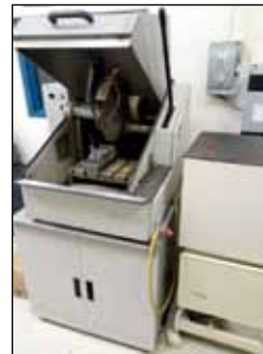
LAB CUT-OFF SAW