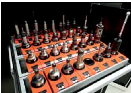
THOUSANDS OF TOOLHOLDERS & PERISHABLE TOOLING