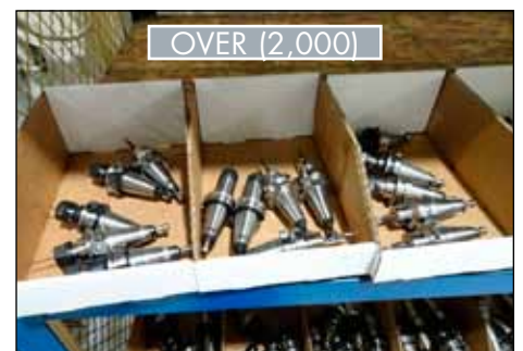
OVER (2,000) 30 TAPER TOOLHOLDERS