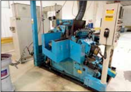
MICRON MACHINERY CNC CENTERLESS GRINDER, MODEL MD-600III-15D