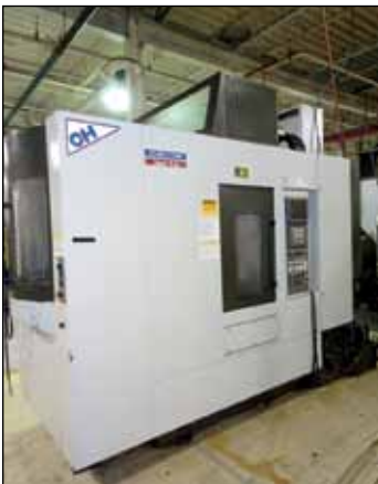
OKUMA & HOWA CNC HORIZONTAL MACHINING CENTER, MODEL MILLAC 44H