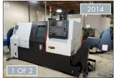
2014 1 OF 2 SAMSUNG CNC TURNING CENTER , MODEL SL 25 & SL25B-500