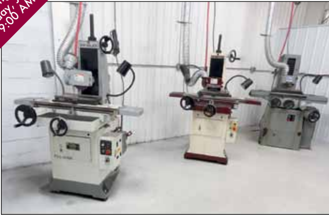
ACER, BOYER SHULTZ, CHEVALIER, B&S, COVEL, SURFACE GRINDERS