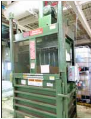
VERTICAL HYDRAULIC CARDBOARD BALER & COMPACTOR