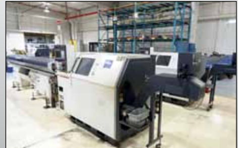
MIYANO/CITIZEN CNC SWISS TYPE BAR TURNING CENTERS, MODEL BNA-42S, EDGE-MIYANO 542 BAR FEED