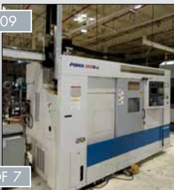
DAEWOO CNC TURNING CENTERS, MODELS PUMA 300LMC, PUMA 300M GL, PUMA 300LMB, PUMA 300B, PUMA 230M GL