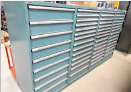
NUMEROUS LISTA TOOL CABINETS