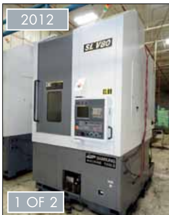
2012 1 OF 2 SAMSUNG CNC VERTICAL TURRETT LATHE MODEL SLV 80