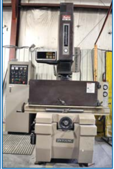
JIN YOUNG EDM Model JDE-45S, SP-50A Control, Work Size 17.7" x 12.6" x 11.8", 3 Axis DRO, Fire Suppression, sn 93031