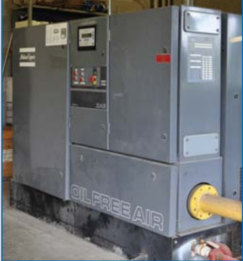
ATLAS COPCO 125 HP Air Compressor