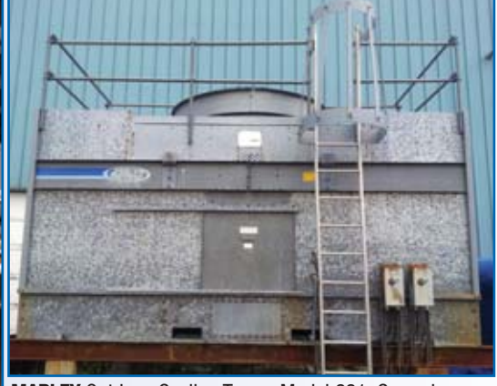
MARLEY Outdoor, Cooling Tower, Model 221, Ground Mounted, sn 51445/90, Plus Assorted Pumps, Piping Etc.

CHEVALIER 12" x 24" Surface Grinder, Model FST-3A1224H, Electro Magnetic Chuck, Pendant Control, Filtration, sn P383B006