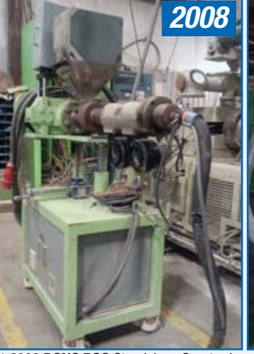
(1) 2008 DONG BOO Standalone Coextruder, Model DBEX-30 Sideloaderx6b