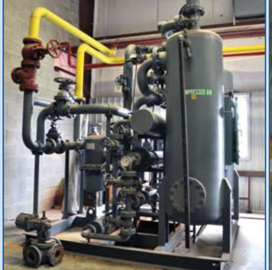
GALAXY Air Dryer, Model 905EH-023

Scissor Lift Table - Table Size: 98" x 30", Lift Height: 60"