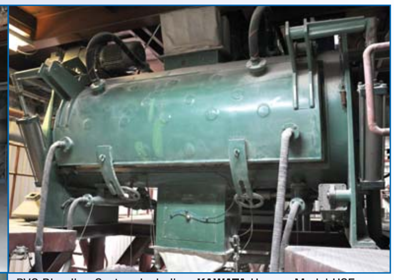
PVC Blending System Including: KAWATA Hopper Model HSE-722W, sn UU40038, plus SHIN HWA Water Cooled Jacketed Mixer, Control Panels Etc.