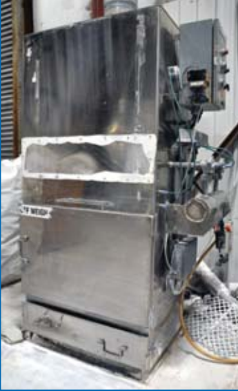
DAESUNG Model ST-160 Compound Dust Collector

PVC Silo: Approx. 12' Dia. x 31' High Compound Silo: Approx. 7.5' Dia. x 19' High