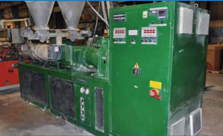
1 of 3 REINFENHAUSER Model BT950