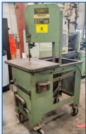
VERTICUT ROLL-IN BANDSAW

2017 MAXCUT (BUFFALO MACHINERY COMPANY LIMITED) MM-430 CNC Vertical Machining Center, Fagor CNC Control, TANSHING 4th Axis Rotary, Probe, ATC, Chip Conveyor, 10,000 RPM, 16" x 36" Table s/n 1621211747