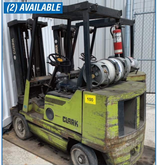
PARTIAL VIEW OF CLARK FORKLIFTS