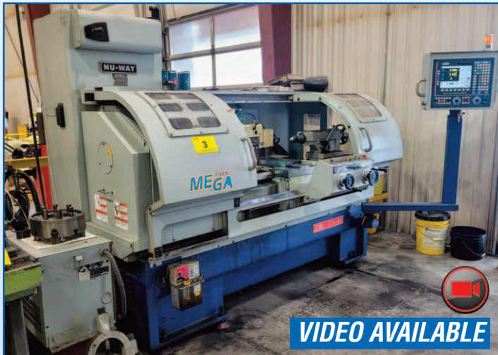
NU-WAY MEGATURN CNL-1740 CNC LATHE