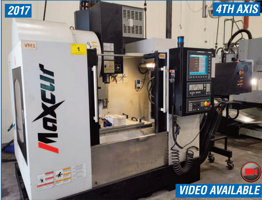
MAXCUT (BUFFALO MACHINERY COMPANY LIMITED) MM-430 CNC VERTICAL MACHINING CENTER

CNC Machine Shop 135 Minto Road, Palmerston, ON