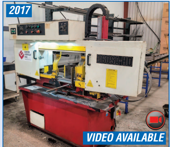
BAXTER VERTICUT 360SA-HD SEMI-AUTO HORIZONTAL BANDSAW

CLOSES: Tuesday August 30 th , 11:00 AM (ET)