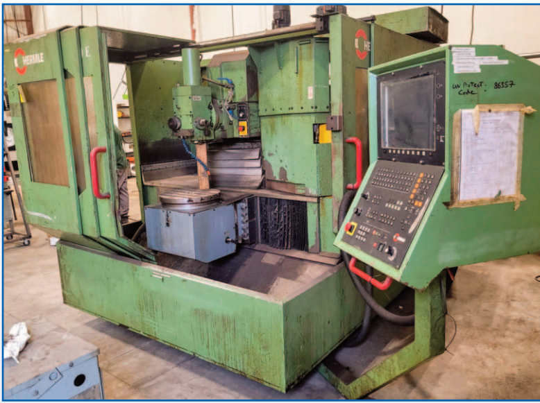
CHERMLE 900UWF CNC UNIVERSAL MILL