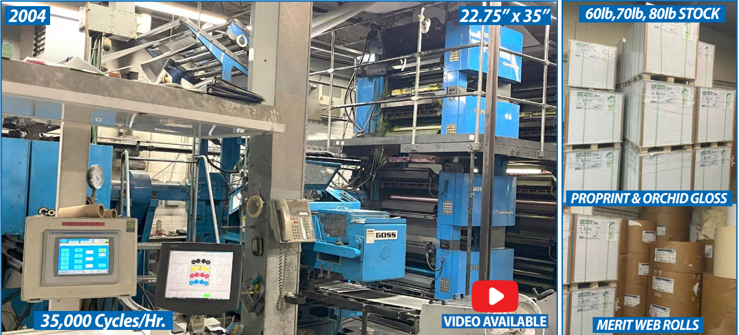
GOSS COMMUNITY SSC PRINTING PRESS, 4X4 HIGH, (2) FOLDERS, (3) MONO UNITS, (2) STACKERS

1101 Finch Ave W, North York, ON M3J 3L6