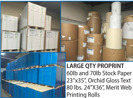
LARGE QTY PROPRINT 60lb and 70lb Stock Paper 23"x35", Orchid Gloss Text 80 lbs. 24"x36", Merit Web Printing Rolls