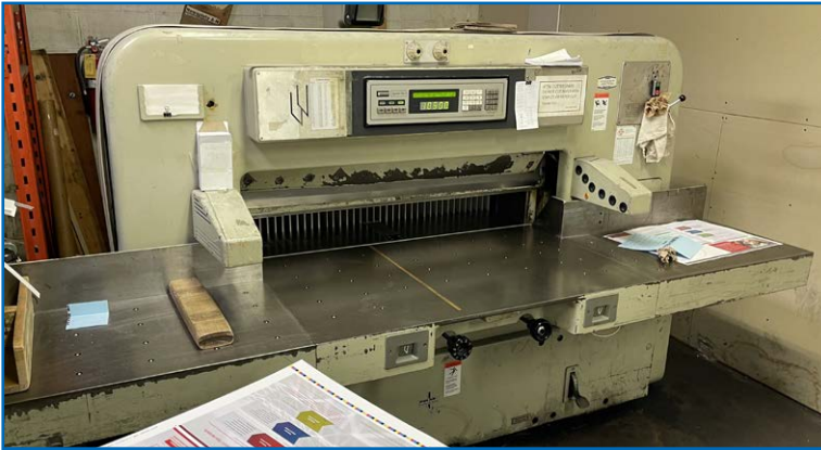
POLAR 115CE Paper Cutter, Gergek System Six Programable Control, Air Tables, s/n 4331582