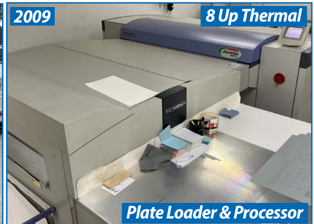
DAINIPPON SCREEN PT-R8600S CTP SYSTEM