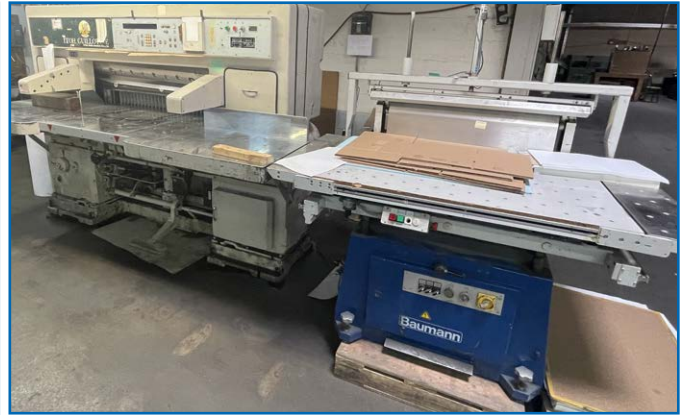
ITOH 115 Guillotine Paper Cutter, 115cm (45"), Air Table Center and Side Air Tables, Programable, Baumann Jogger Model BSB 3 L, s/n 3465