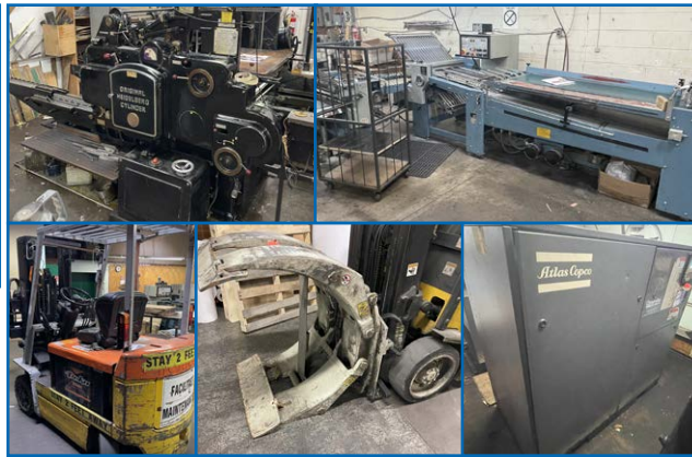
ALSO: STAHL Folders, DICK MOLL Folder/Gluer, HEIDELBERG Original Cylinder Die Cutting Machine, TOYOTA 5,000 lbs. Forklift, YALE 4850 lbs. Forklift with Hydraulic Clamp for Paper Rolls, s/n 8188, Plotters, Racking, Paper Stock, Paper Drills, Pallet Racking and More.