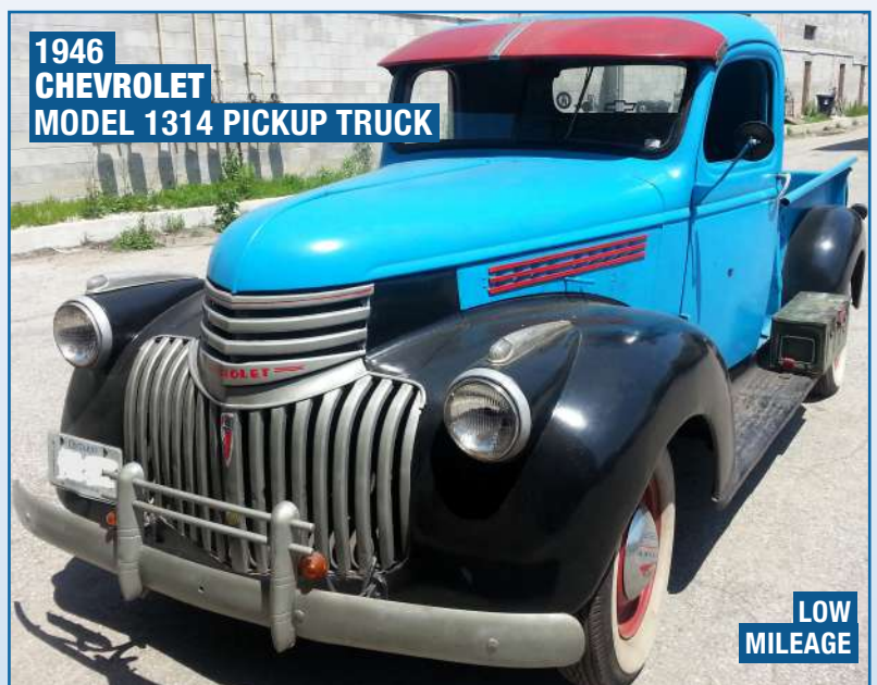
1946 CHEVROLET MODEL 1314 PICKUP TRUCK