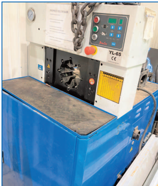
YEONG LONG YL-65 HYDRAULIC CRIMPER