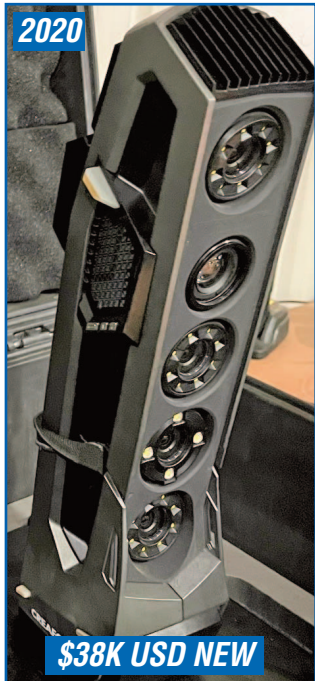
CREAFORM GO!SCANSARK 3D SCANNER

ALSO: Press Brake Tooling, hand and power tools, machine vices and tooling, saws, compressors, Steel Tables, Fume Extractors, office furniture, computers and more.