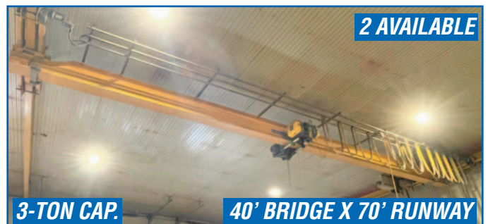
HERCULES OVERHEAD BRIDGE CRANES