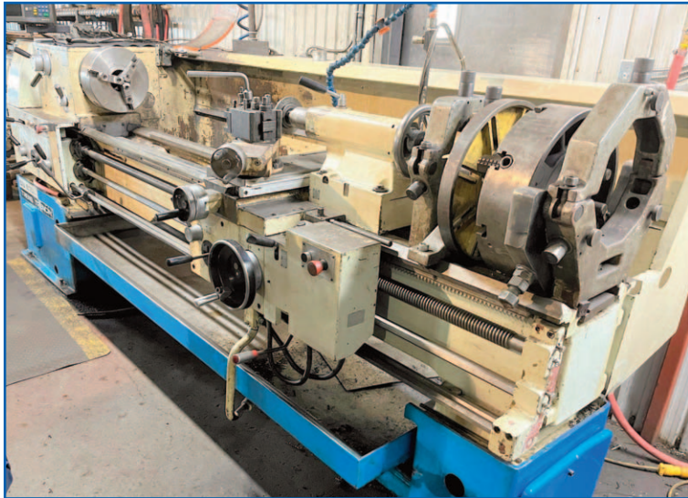
TOS SN 500N ENGINE LATHE