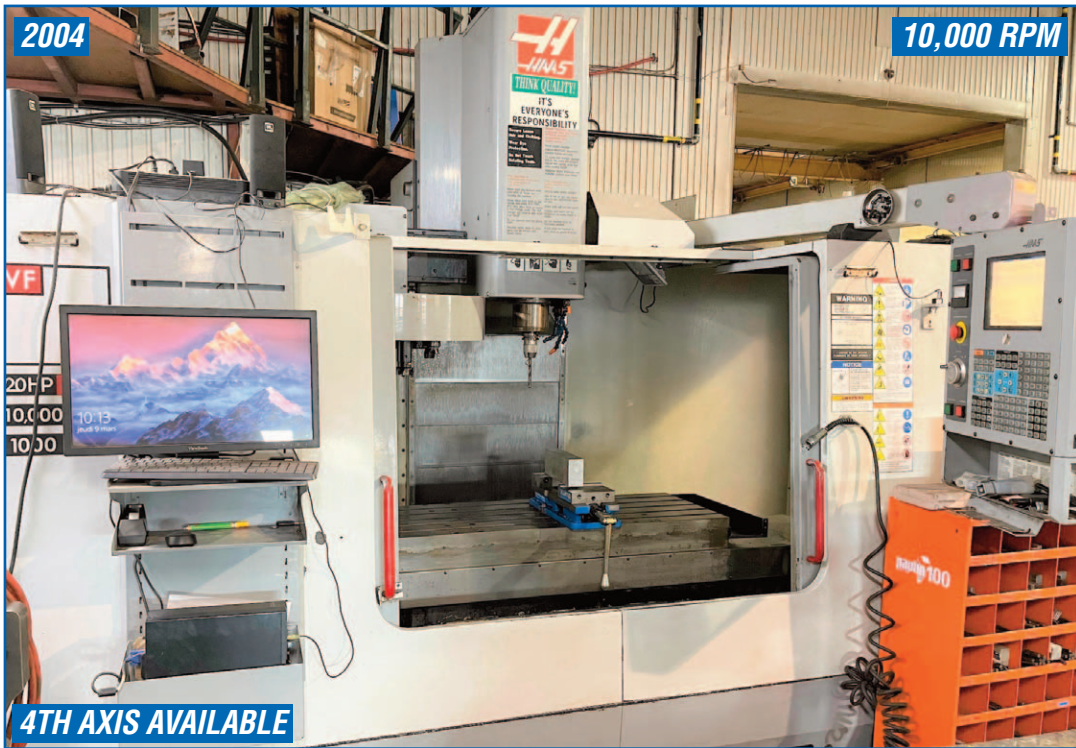
HAAS VF-3D CNC VERTICAL MACHINING CENTER