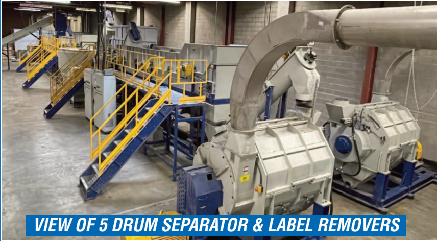
VIEW OF 5 DRUM SEPARATOR & LABEL REMOVERS

2019 RECYCLING & PELLETIZING EXTRUSION LINE