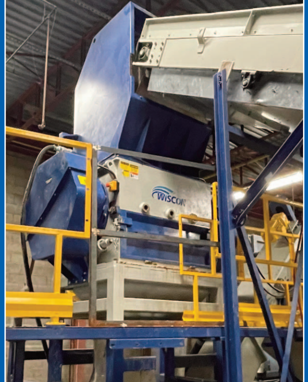
2019 WISCON ROTARY DRUM SHREDDER

2019 RECYCLING & PELLETIZING EXTRUSION LINE