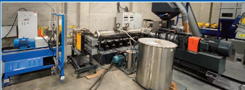
2018/2019 USEON CO-TWIN EXTRUSION LINE

2019 RECYCLING & PELLETIZING EXTRUSION LINE