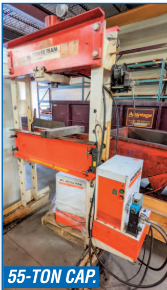
55-TON CAP. POWERTEAM SHOP PRESS