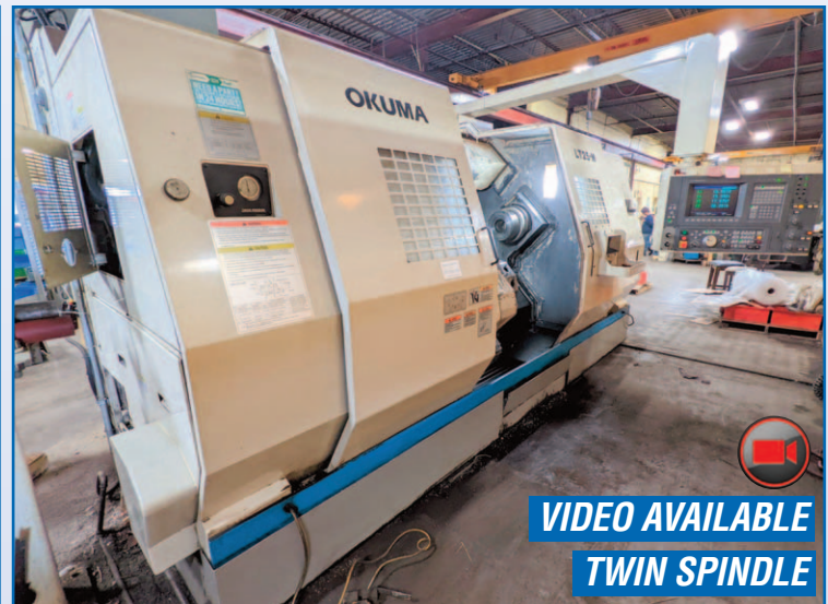
OKUMA LT-25M CNC TURNING CENTER

CLOSES: Thursday April 28 th , 11:00 AM (ET)