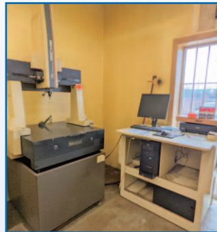
MITUTOYO B504B CMM