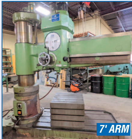
7' ARM POBEDA RB70-1600 RADIAL ARM DRILL

PLUS: General Machining Tooling, LARGE QTY. Precious Metals, Bar Stock, Scrap Metal, Platform Scale w/ DRO, Racking, Parts Storage Cabinets, Workbenches, Toolboxes, Power & Hand Tools, Strapping Cart, Ladders, Broach Tooling, Measuring System w/ DRO, Drill Presses, Forklift Man Cage, Dollies, Dump Hoppers, Drill Bits, Reamers, End Mills, Cutting Tools, Carbide, Tool Holders, Vises, Precision Instruments, Warehouse Fans, Parts Washer, Angle Plates, Portable Office, Pressure Testing System, Belt Sander, Cantilever Racking, Warehouse Carts, Pedestal Grinders, Tool/Cutter Grinders, Granite Surface Plates, Height Gauges, Micrometers, Verniers, Rotary Tables, Shop Vacs, Indexing Fixtures, Employee Lockers, Complete QC Department, Optical Comparator, Hardness Testers, LISTA Cabinets, Office Furniture & Much More!