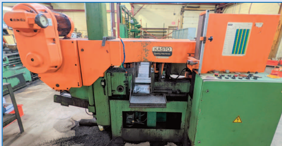
KASTO HBA360AU BANDSAW