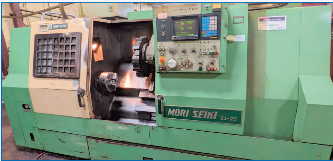
MORI-SEIKI SL-25B CNC TURNING CENTER