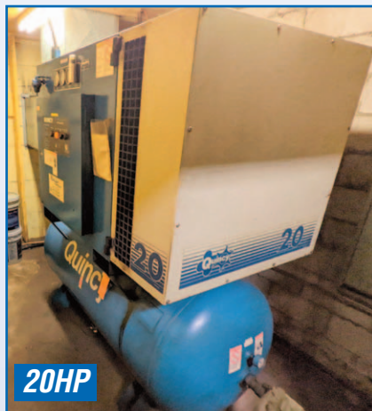
20HP QUINCY QMT20ACA42SF COMPRESSOR