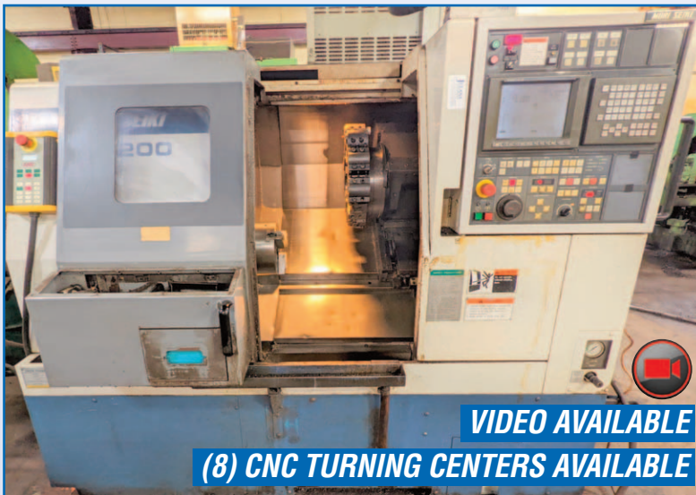
MORI-SEIKI SL-200 CNC TURNING CENTER