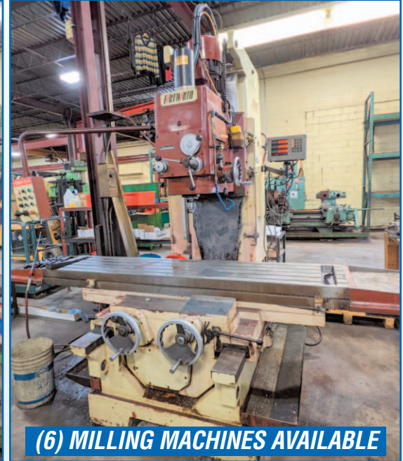
FORTWORTH VBM-5VL VERTICAL MILL