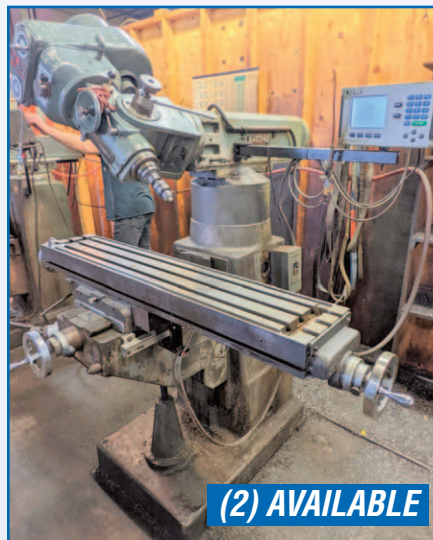
EX-CELL-O 602 VERTICAL MILL