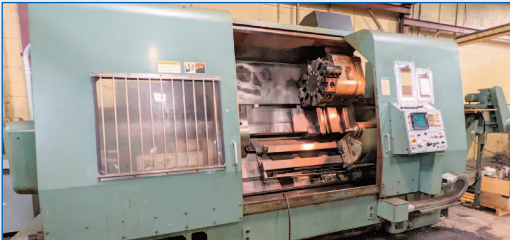
MORI-SEIKI SL-7A CNC TURNING CENTER