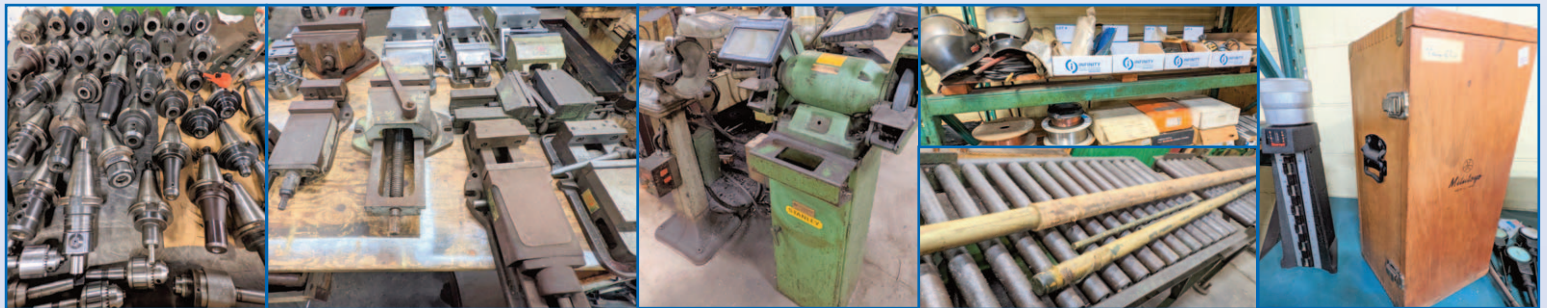
PARTIAL VIEW OF PLANT SUPPORT EQUIPMENT