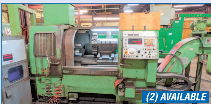
MORI-SEIKI TL-5A CNC TURNING CENTER