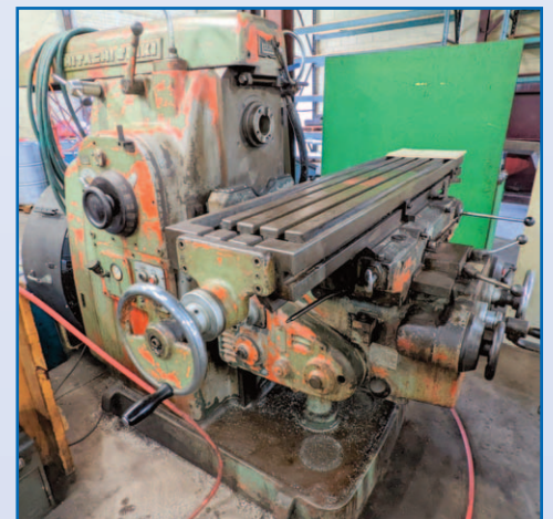
HITACHI SEIKI 2ML-P HORIZONTAL MILL