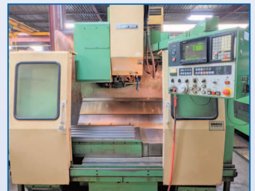
MORI-SEIKI MV-40 CNC VERTICAL MACHINING CENTER

TOS W100A Horizontal Boring Mill, Heidenhain 4-Axis DRO, 49" x 49" Powered Rotary Table, Power Drawbar, 3.93" Spindle, 50 Taper, Travels: X-63", Y-44", Z-49", s/n 3610