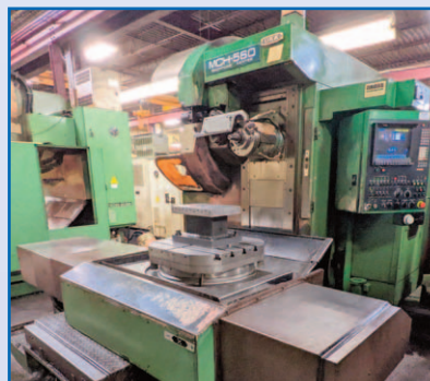
OKK MCH-560 CNC HORIZONTAL MACHINING CENTER