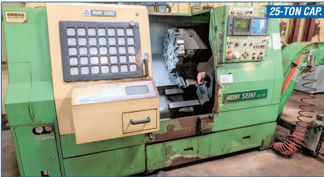
MORI-SEIKI SL-25B5 CNC TURNING CENTER