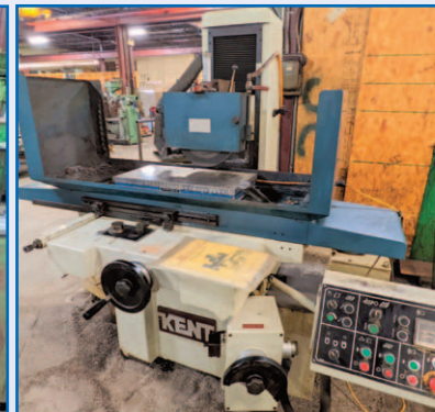
KENT KGS-63AMD SURFACE GRINDER