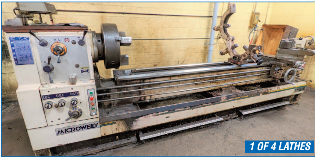
MICROWEILY TY-26120 LATHE