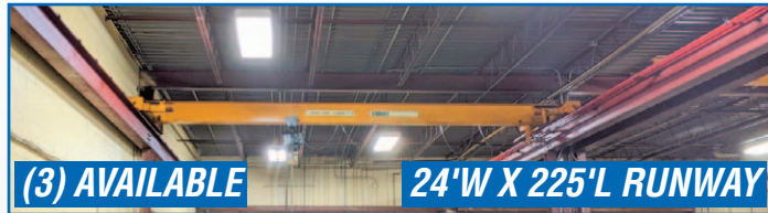
(3) AVAILABLE 24'W X 225'L RUNWAY