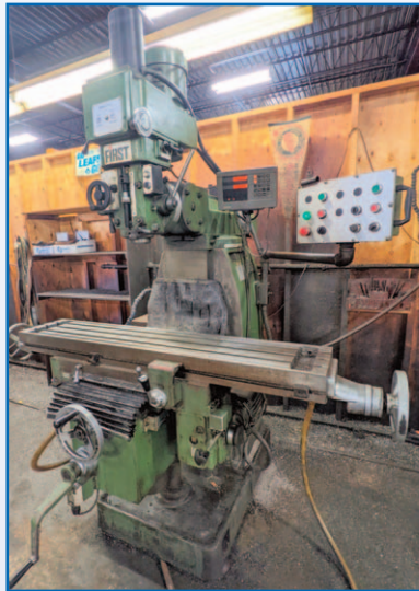
FIRST LC-20VSG VERTICAL MILL

HERBERT No. 9C-30 Combination Turret Lathe, Acu-rite 3-Axis DRO, 3-Jaw Chuck, 30" Swing Over Bed, 21" Swing Over Cross Slide, 4-1/4" Spindle Bore, Wheeler Polygon Box, Control Cabinet, Transformer