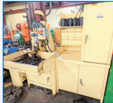
SUNNEN MBB1650 PRECISION HONE