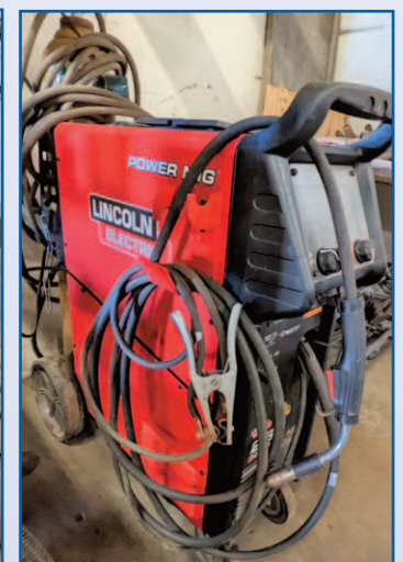
LINCOLN ELECTRIC 260 POWER MIG WELDER