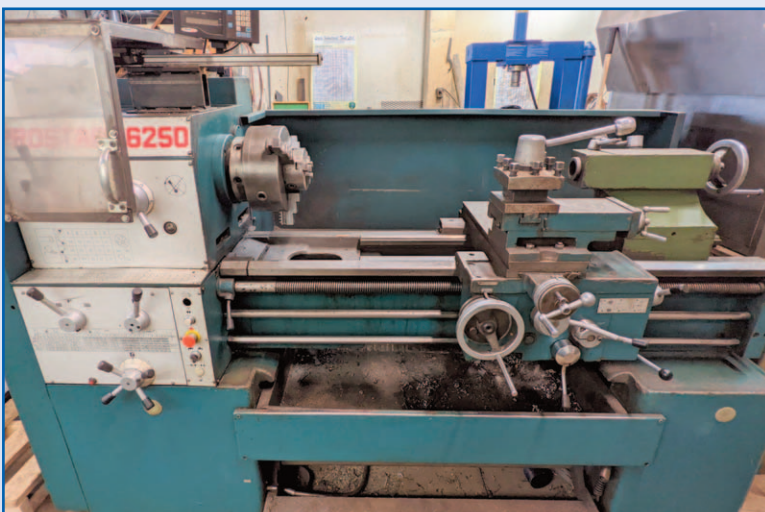
PROSTAR 6250 ENGINE LATHE