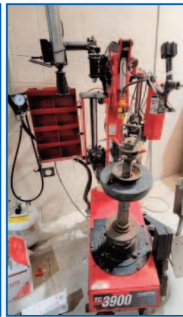
HUNTER TIRE CHANGER

2013 HAAS ST-30 CNC Lathe, CNC Control, 10" 3-Jaw Chuck, 12-Station Turret, Tailstock, Presetter, Chip Conveyor, s/n 3095054