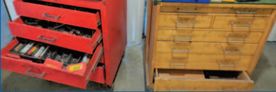
PARTIAL VIEW OF PLANT SUPPORT