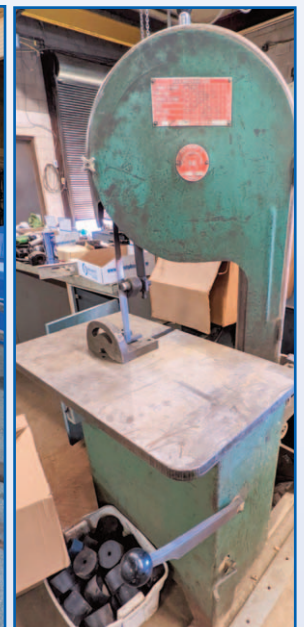
K&K ROLL-IN SAW