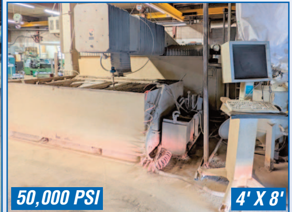
50,000 PSI 4' X 8' FLOW EAGLE WATER JET

Visit infinityassets.com for complete specs and additional photos