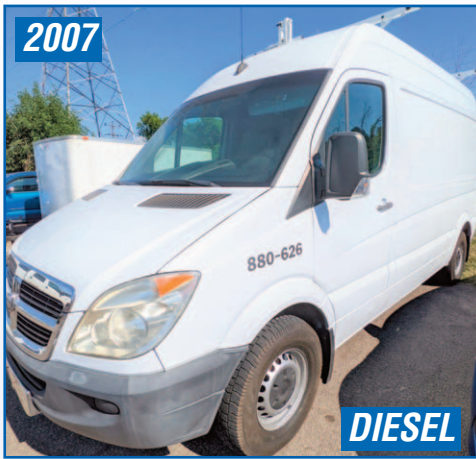
DODGE SPRINTER VAN