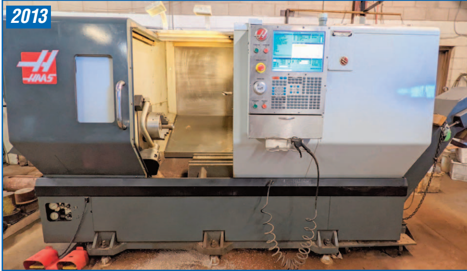
2013 HAAS ST-30 CNC LATHE