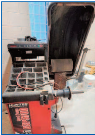
HUNTER WHEEL BALANCER