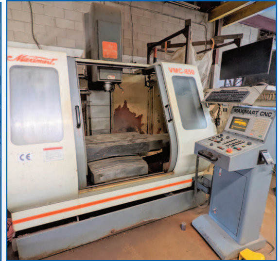
MAXIMART VMC-850 CNC VERTICAL MACHINING CENTER